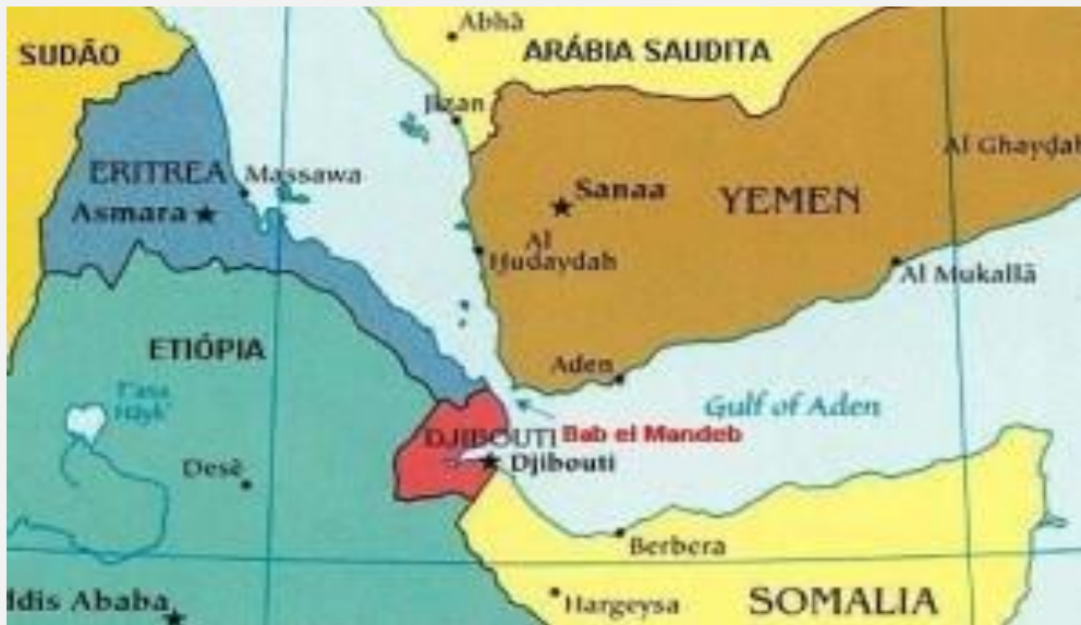
Figure 1 - Horn Africa map

The Eritrean Seaman Union (ESU) has continued its analysis of the current regional situation in the Red Sea and its impact due to Houthi activity.