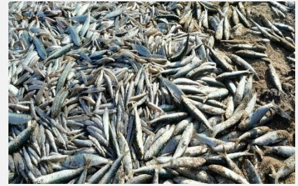
Figure 5 - contaminated fish washed ashore

people. These attacks continue to disrupt health and humanitarian efforts, obstructing urgent international coordination needed to address the health and security challenges in the region.