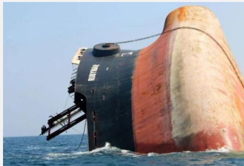
Figure 2 - Figure 2The Rubymar partially submerged, March 7, 2024.

The Eritrean Seafarers Union is deeply concerned about the seafarers, the economic activities of traditional sailors, and the environmental and security situation along the Red Sea route, particularly regarding the voiceless Eritrean traditional sailors and the fragile ecosystem of the Eritrean Red Sea. The ongoing attacks in the area, combined with the resulting pollution, are impacting the Eritrean coastline and neighboring countries