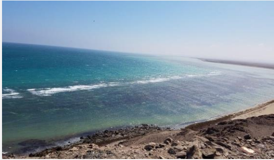
Figure 7 - Sea pollution