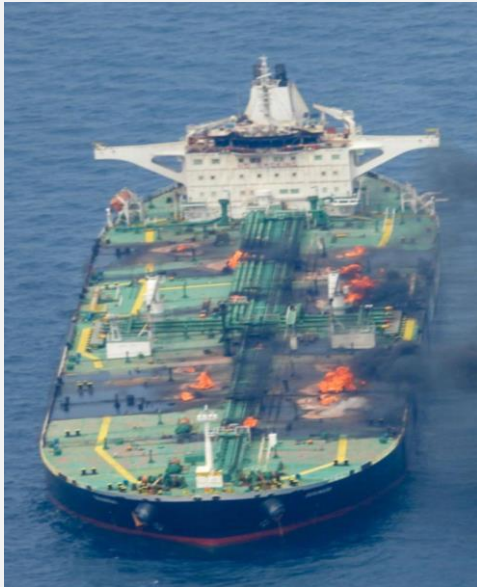
Figure 3 - MV Sounion Greek oil ታኻር

Additionally, the Greek-flagged oil tanker MV Sounion has been burning since August 2024, following an attack by Houthi militants. Coalition naval forces are preparing to rescue the vessel, which contains 150,000 tonnes of crude oil, posing a major environmental threat.