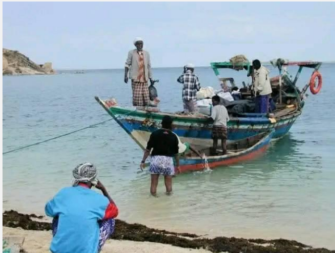
Figure 8 - Traditiona Eritrean Afar seaman's

It is well-known that the traditional sailors of the Afar people of Eritrea have been banned from using the Red Sea for over 20 years, preventing them from accessing their traditional livelihoods.