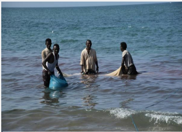
Figure 4 - traditional fishing Afar Eritrea

These attacks have had a devastating impact on the Afar people of Eritrea, whose cultural activities, especially fishing and maritime trade, have been severely disrupted. Our sources confirm that the livelihoods of traditional Eritrean fishermen in the Denkeli regions, home to the Afar people, have been directly affected. If left unaddressed, the long-term damage to marine ecosystems and resources could take decades to repair. Without prompt action, countries along the Red Sea coast may be unable to protect themselves from the escalating marine pollution. International intervention is urgently needed to mitigate the damage and restore stability.